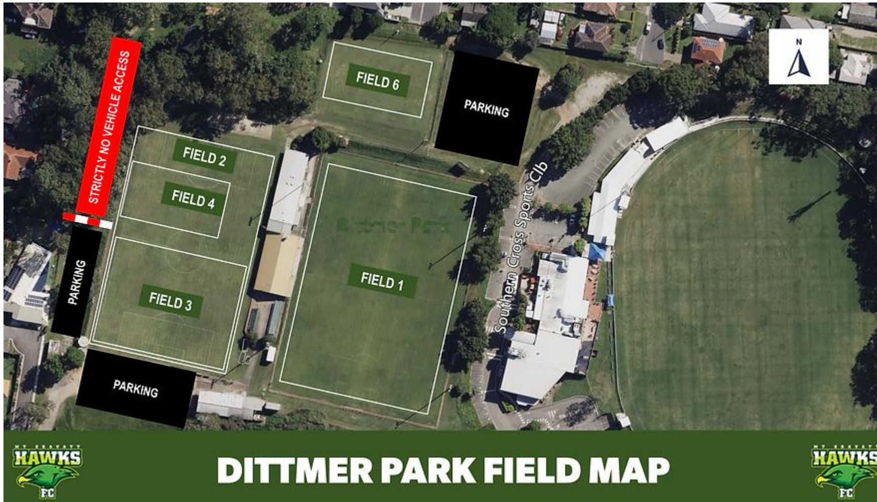
DITTMER PARK FIELD MAP